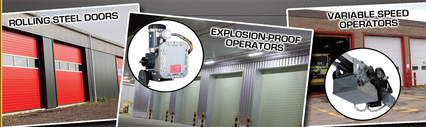
ROLLING STEEL DOORS